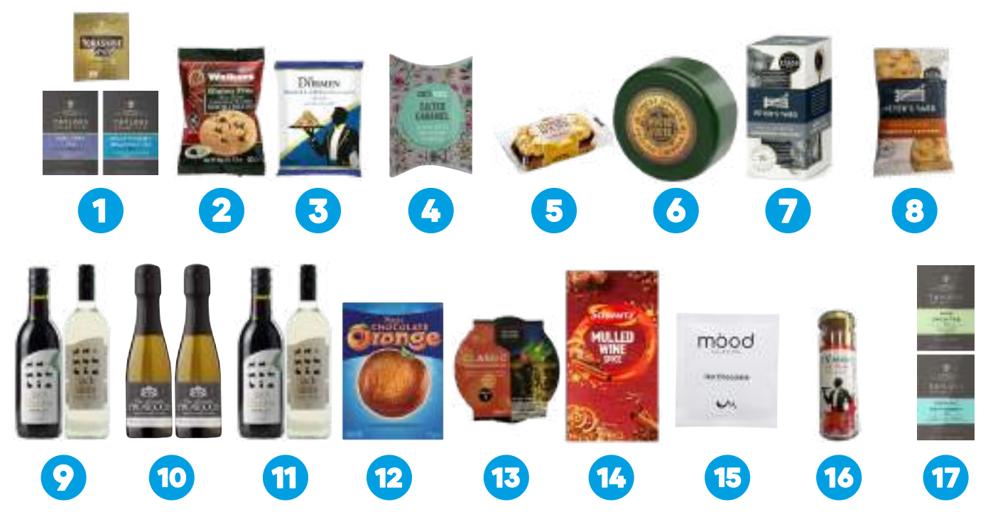
1. Tea Bags - Yorkshire Gold, Earl Grey, Decaf Breakfast. 2. Chocolate Chip Shortbread 2 pack. 3. Dormen's Peanuts. 4. Salted Caramel Chocolate Buttons 2 pack. 5. Ferrero Rocher 2 pack. 6. Finest Vintage Cheddar. 7. 90g Box of Crackers. 8. 9g Pack of Crackers, 2 pack. 9. Red and White Wine 200ml. 10. 2 Prosecco 200ml. 11. Red or White Wine 200ml. 12. Terry's Chocolate Orange. 13. Christmas Pudding 11g. 14. Mulled Wine Spice Sachet. 15. Mood Hot Chocolate Sachet. 16. Dormen's Jelly Beans. 17. Tea Bags - Pure Green and Organic Peppermint.